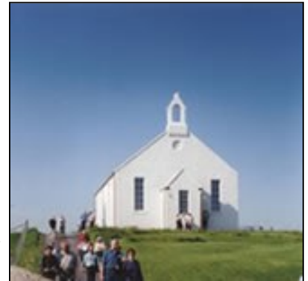
Above: Griminish Church

The present Church was built in Griminish, in the centre of Benbecula, in 1886. Today, Benbecula Parish Church of Scotland endeavours to continue the Christian witness and service started in this island by members of Columba's community from Iona in the sixth and seventh centuries. Come and soak up the spirit of Columba! We already have two candidates for CTS membership. Lets make it more.