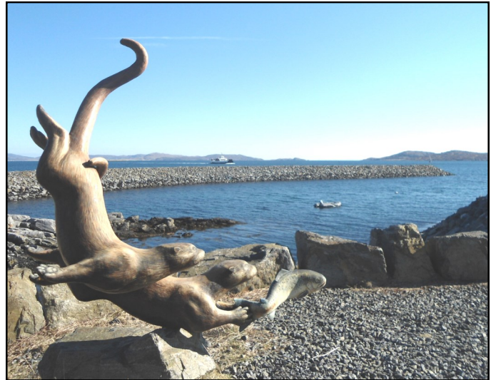
Otter sculpture at the harbour on the Isle of Barra waits to welcome the ferry arriving from Eriskay

Plans announced for the 2014 Clan MacMillan International Gathering on Scotland's Outer Hebrides 21st - 27th June