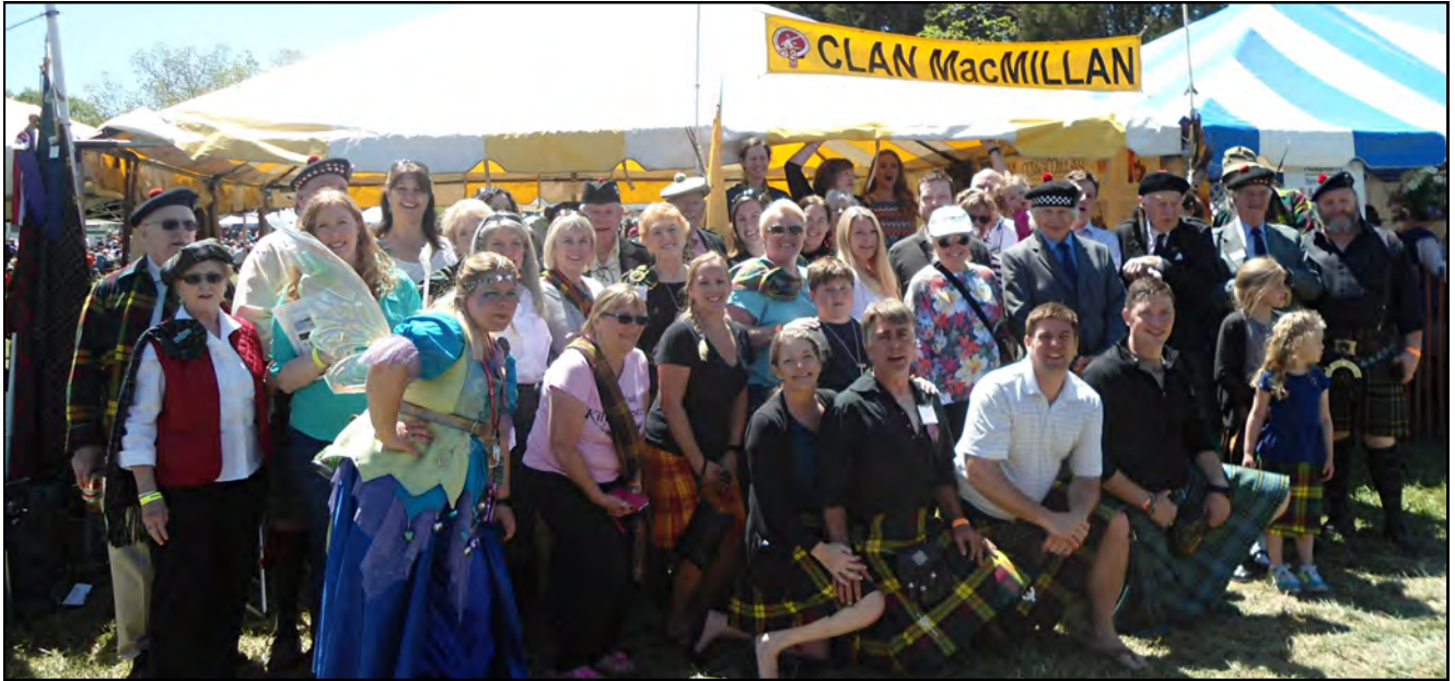
Above: The Appalachian Branch and guests in front of their tent at Loch Norman.