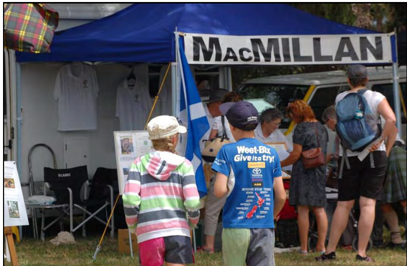
Clan MacMillan Tent at the Turakina Highland Games