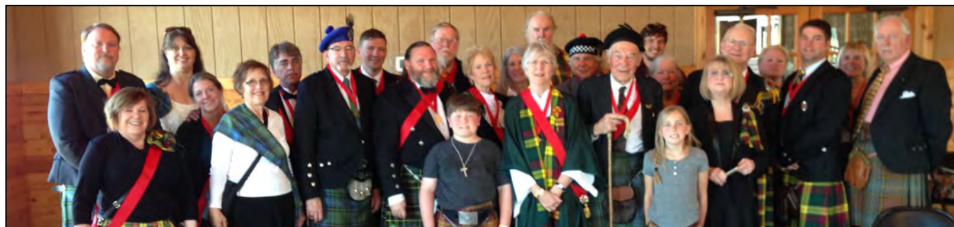
Attendees at the Clan MacMillan Appalachian Branch, CTS Service, Loch Norman Highland Games, NC, USA 17 April 2016

Grants by CTS to Clan MacMillan International Centre (CMIC) In June 2016, CTS granted $1,000.00US which brings the total CTS Grants to CMIC to $43,143.00US since 1996 averaging $2,157.15US per year for 20 years.